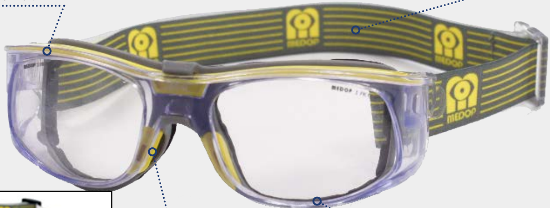
Xtreme Hybrid SOLAR

Elastic strap that can be adjusted with a clasp